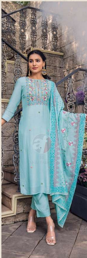
GOLDEN 3635 Meadows