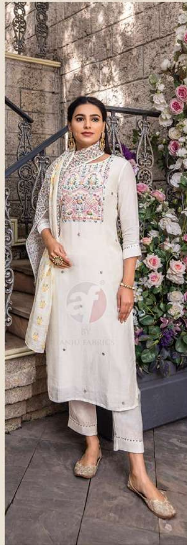
GOLDEN 3633 Meadows