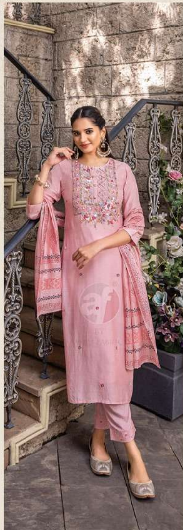
GOLDEN 3636 Meadows