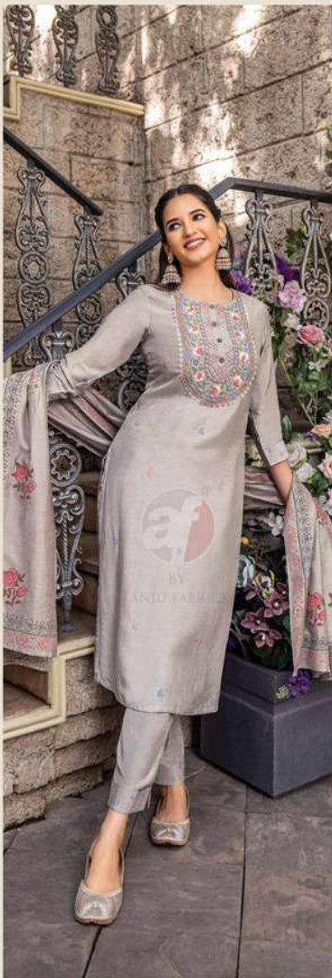
GOLDEN 3634 Meadows