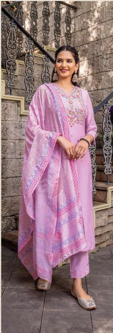
GOLDEN 3631 Meadows