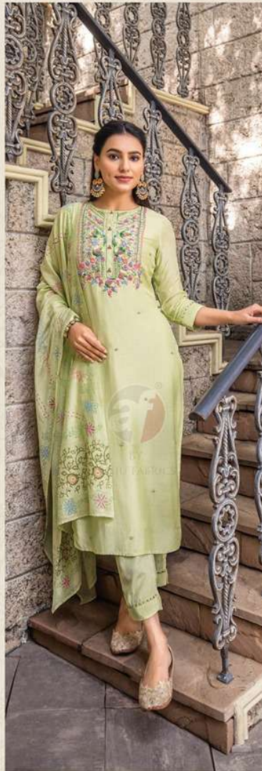
GOLDEN 3632 Meadows