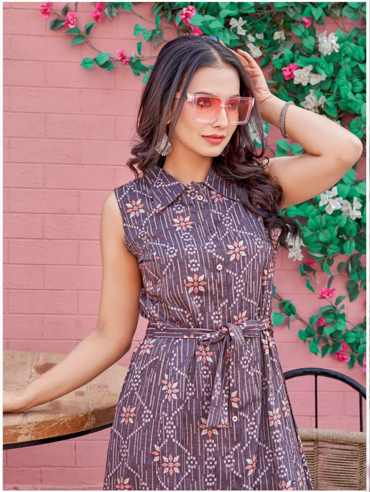
With its richly embellished border and tassels, this gorgeous green saree perfectly enhances the feminine silhouette.